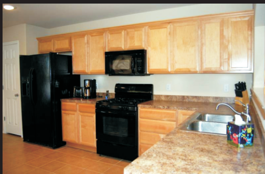
Boxelder Court Courtyard Boxelder Court Facade Remodeled Kitchen*